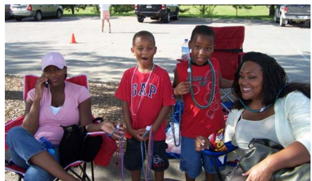
Reaching Out...Nebraska team members at an outdoor concert. Survivors were invited to encourage integration to the community. Members of the public were also provided with information on the status of survivors in Omaha and how to get involved with local support organizations. Team members handed out Mardi Gras beads to survivors and community members.

May 18, 2006: Reaching Out...Nebraska staff provided an informational presentation about the needs of Katrina evacuees to the People's City Mission in Lincoln. The People's City Mission provides temporary housing to homeless families and individuals, and was one of the local entities which had traveled to the Gulf area and brought evacuees to Lincoln.