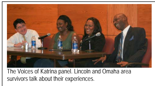
The Voices of Katrina panel. Lincoln and Omaha area survivors talk about their experiences.

Anniversary events - September 6, 2006: A roundtable panel discussion entitled " The Voices of Katrina " was held at the University of Nebraska-Lincoln. The event was an opportunity for three evacuees who had relocated to Nebraska to talk about their experiences during and after the Hurricane's landfall, and how they