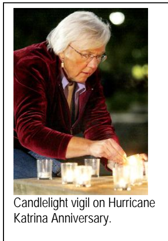
Candlelight vigil on Hurricane Katrina Anniversary.

Anniversary events - August 28, 2006: Working with the University of Nebraska-Lincoln, Reaching Out...Nebraska and Katrina Aid Today partnered to promote a week-long series of Anniversary events in both Lincoln and Omaha. The events were kicked off with a candlelight vigil in Lincoln on the anniversary of Katrina's landfall. Reaching Out...Nebraska and Katrina Aid Today notified area evacuees about the events and encouraged them to attend. From August 28-31, Reaching Out...Nebraska Omaha Team members were present at Omaha public housing authorities to provide counseling and support for survivors who wanted to talk and reflect on their experiences.