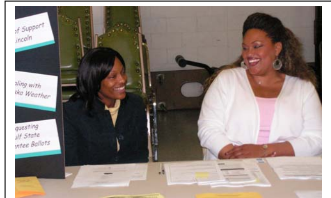
The Reaching Out...Nebraska informational booth at the African-American Family Empowerment Summit.

April 2, 2006: Reaching Out...Nebraska coordinated with the Lincoln NAACP chapter and University of Nebraska-Lincoln Black Graduate Students Association and set-up an informational booth at the first African-American Family Empowerment Summit community health fair in Lincoln. Outreach staff networked with other community entities and members of the public, and distributed educational materials about the Reaching Out...Nebraska program and the needs of evacuees.