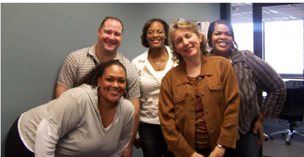
Reaching Out...Nebraska staff members based in Omaha, NE.

As the RSP program proceeded, the Project Manager also began conducting one-on-one meetings with team members on an as-needed basis. The purpose of doing so was to monitor and address any signs of stress among team members, who were more likely to share their thoughts on a one-on-one basis rather than in a group, as well as make sure that team members were adequately completing the necessary paperwork and making progress in the field. The small size of the Reaching Out...Nebraska team allowed the Project Manager to conduct the one-on-one meetings.