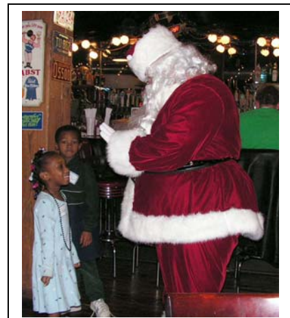
Children of survivors chat with Santa at a Reaching Out...Nebraska event.

December 18, 2006 Holiday Event at Henry Doorly Zoo Between 80-100 Lincoln and Omaha-area survivors attended a day long visit to the Omaha Zoo. The event was