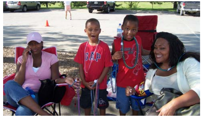
Reaching Out...Nebraska team members at an outdoor concert. Survivors were invited to encourage integration to the community. Members of the public were also provided with information on the status of survivors in Omaha and how to get involved with local support organizations. Team members handed out Mardi Gras beads to survivors and community members.

May 18, 2006: Reaching Out...Nebraska staff provided an informational presentation about the needs of Katrina evacuees to the People's City Mission in Lincoln. The People's City Mission provides temporary housing to homeless families and individuals, and was one of the local entities which had traveled to the Gulf area and brought evacuees to Lincoln.