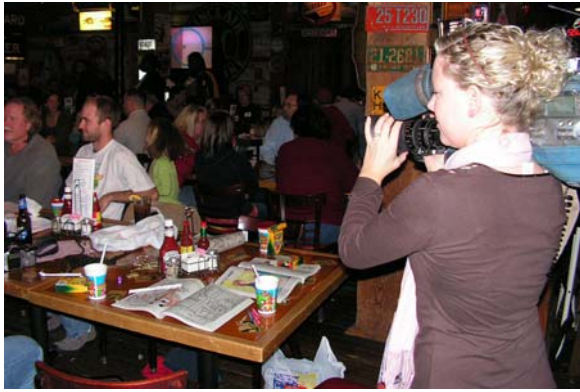
Camera crews from a local news station cover a community holiday event for survivors.

As noted in the ISP report, an informational website 3 for Reaching Out...Nebraska was developed and hosted by the University of Nebraska Public Policy Center. The website contained two phone numbers for evacuees and others affected by Hurricane Katrina to call for further information. One 1-800 line – the Rural Response Hotline - was