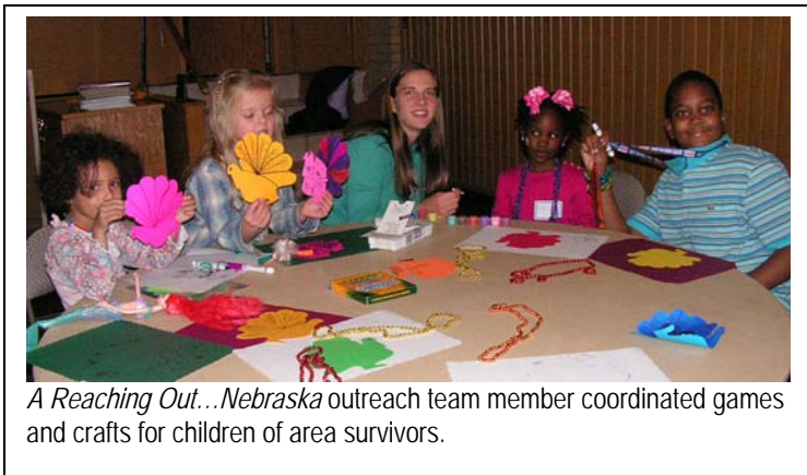
A Reaching Out...Nebraska outreach team member coordinated games and crafts for children of area survivors.

the presentation was to educate community members about the ongoing needs of evacuees.