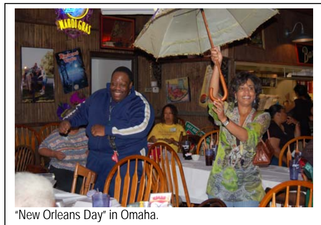
"New Orleans Day" in Omaha.