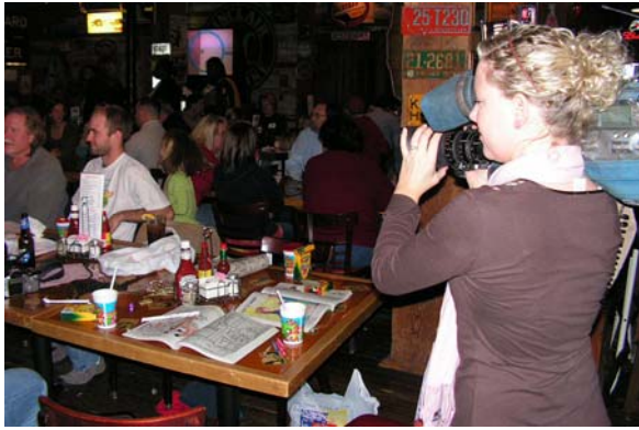
Camera crews from a local news station cover a community holiday event for survivors.

As noted in the ISP report, an informational website 3 for Reaching Out...Nebraska was developed and hosted by the University of Nebraska Public Policy Center. The website contained two phone numbers for evacuees and others affected by Hurricane Katrina to call for further information. One 1-800 line – the Rural Response Hotline - was