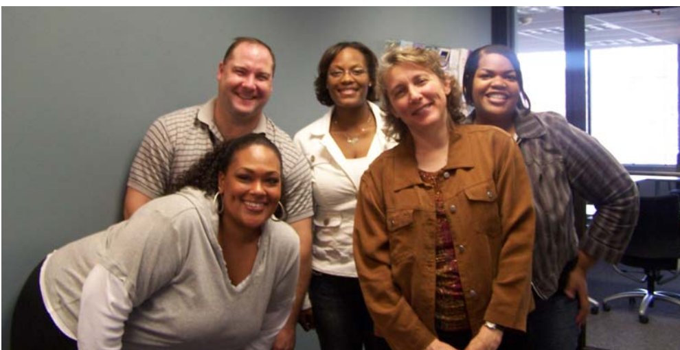
Reaching Out...Nebraska staff members based in Omaha, NE.

As the RSP program proceeded, the Project Manager also began conducting one-on-one meetings with team members on an as-needed basis. The purpose of doing so was to monitor and address any signs of stress among team members, who were more likely to share their thoughts on a one-on-one basis rather than in a group, as well as make sure that team members were adequately completing the necessary paperwork and making progress in the field. The small size of the Reaching Out...Nebraska team allowed the Project Manager to conduct the one-on-one meetings.