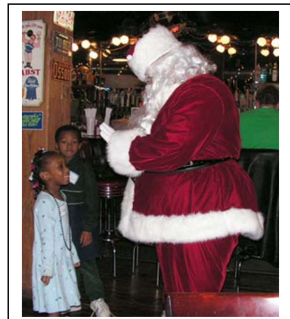
Children of survivors chat with Santa at a Reaching Out...Nebraska event.

December 18, 2006 Holiday Event at Henry Doorly Zoo Between 80-100 Lincoln and Omaha-area survivors attended a day long visit to the Omaha Zoo. The event was